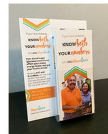
GlycoMark "Know Both Your Numbers" Poster/Display