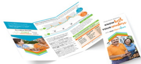
GlycoMark "Know Both Your Numbers" Patient Guide

Don't forget to also request copies of the NEW Patient Guide and Poster/Display for your office!